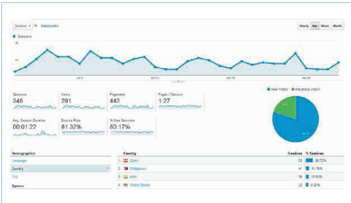
Figure 2. Example of a Google Analytics report

While most LMSs incorporate their own tools to automatically generate customizable statistics reports of course development, these are often quite basic. For instance, Moodle ( https://moodle.org/ ) allows several types of report to be generated: (a) logs for selected activities, students, items and periods of time; (b) live logs, which include recent activity; (c) activity reports, presenting the numbers of views of each activity in a course; (d) course participation, analyzing the actions of selected students for a given period and activity; and (e) data on activity completion. Blackboard ( http://es.blackboard.com/sites/international/globalmaster/ ) also offers several types of report, e.g., (a) user activity overview, which displays overall system and course activity for all students; (b) user statistics, consisting of the average number of students and other users per month and per day; (c) user activity in forums; and (d) user activity in groups. Another interesting tool that can be easily employed is Google Analytics (Figure 2). It can provide information about the number of visits, pages visited, the average duration of each visit, demographics, etc. Regarding monitoring student activity and performance, Lera-López, Faulin, Juan, & Cavaller (2009) review the tools provided by Sakai, WebCT/Blackboard and Moodle.