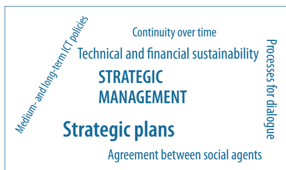
Figure 2. Key factors: strategic management

The “Knowledge and Information Society” (UNESCO, 2005) requires citizens to be more digitally literate if they are to reach their full level of personal and professional development (OECD, 2010). In most countries exclusion risk factors exist that are associated with access to digital resources and the proper use of the Internet.