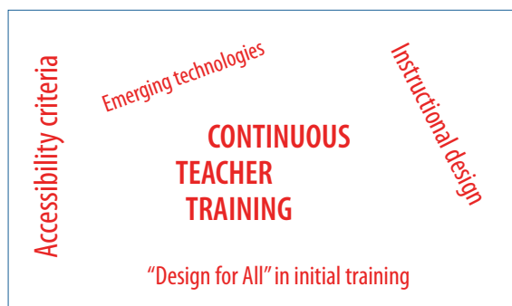
Figure 4. Key factors: Continuous teacher training

The “digital divide” highlights the need to introduce inclusive strategic education plans, where inclusion is understood as a continuous process that takes into account all individuals in society and their wide range of needs and that aims to enable individuals to participate in every sphere of society and reduce exclusion to the point of eliminating it (UNESCO, 2009; Fundación Orange, 2014).