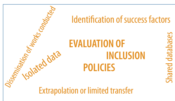
Figure 5. Key factors: Evaluation of inclusion policies