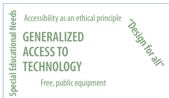
Figure 3. Key factors: Generalization of access