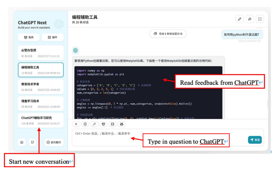
Fig. 1 ChatGPT-facilitated programming platform used in CFP mode

Four methods were used to collect and analyze the data for this study. We documented the programming behaviors of the students by monitoring platform logs and recording computer screen videos (excluding audio). For research facilitation, we selected video recordings of the data obtained during the final class session (specifically, the radar chart task), which averaged 40 min per learner, resulting in a total of 3280 min. We selected the final session for data collection for two primary reasons: first, it focused on a comprehensive programming task that provided a holistic view of how ChatGPT integrated into resolving programming challenges and demonstrating programming performance; and second, informal observation revealed that students in the experimental group had developed performance in utilizing ChatGPT and were more actively involved in this session. By utilizing clickstream analysis (Filva et al., 2019) on this data, we were able to discern the programming behaviors of the students. We conducted the video analysis using a recurrent coding procedure that adhered to a previously approved coding framework (Sun et al., 2021a, b, c, d). Following an initial individual evaluation of the screen-captured videos by two coders who were well-versed in video analysis, they identified preliminary codes representing programming behaviors. Subsequently, the coders collaboratively discussed these codes to arrive at a final coding arrangement, as detailed in Table 1.